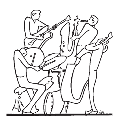
The Acoustic Jazz Quartet